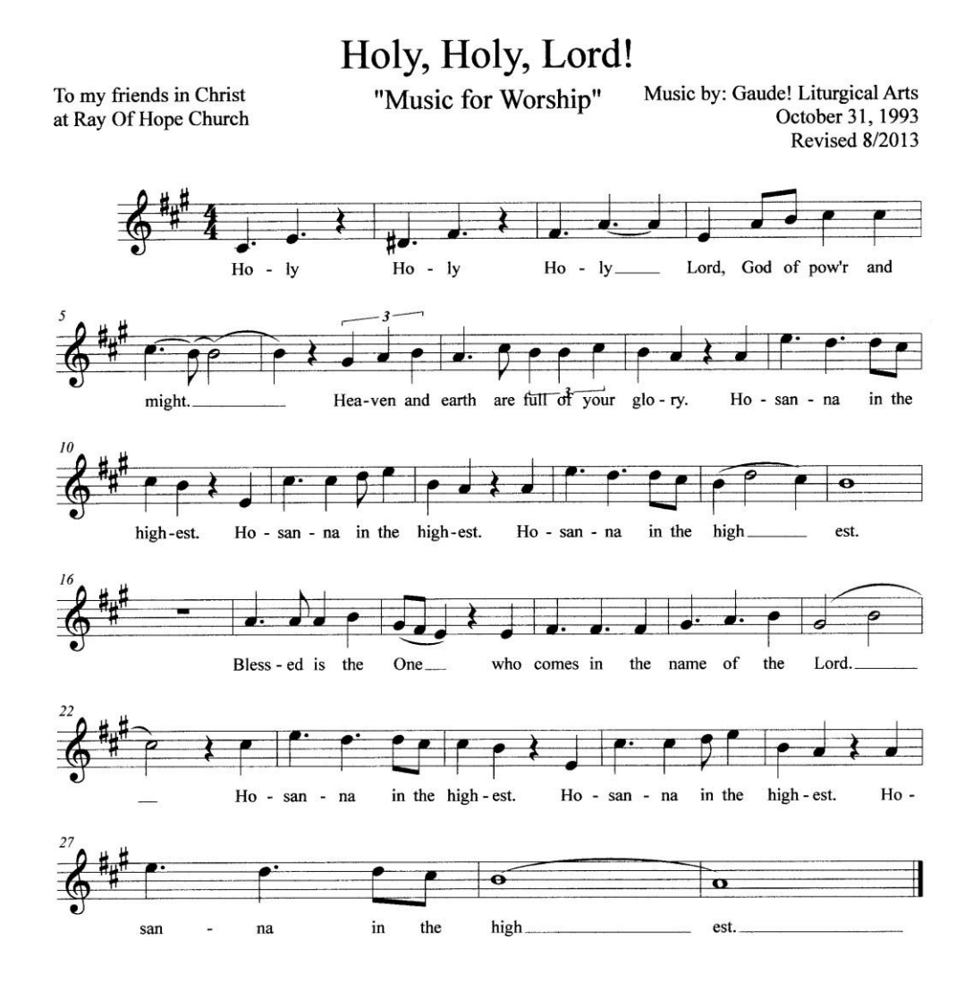
©1993 by Gaude! Liturgical Arts. All Rights Reserved. International Copyright Secured. Reprinted here under CCLI#706121